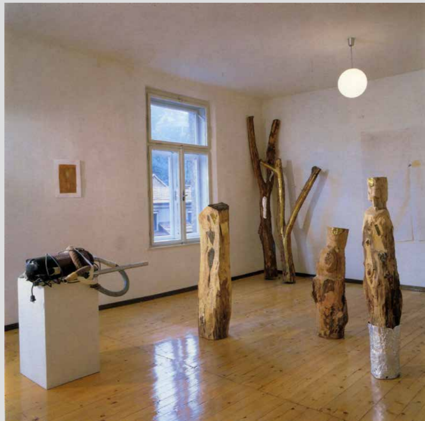
Grand Prix of The Fourth Triennial of Croatian Sculpture: The Room , 1986–1991