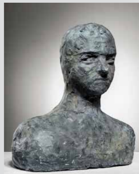
Exhibition setup: Precizni mehanizam / Precise Mechanism, 1959 Torzo / Torso, 1947 Bista / Bust, 1953