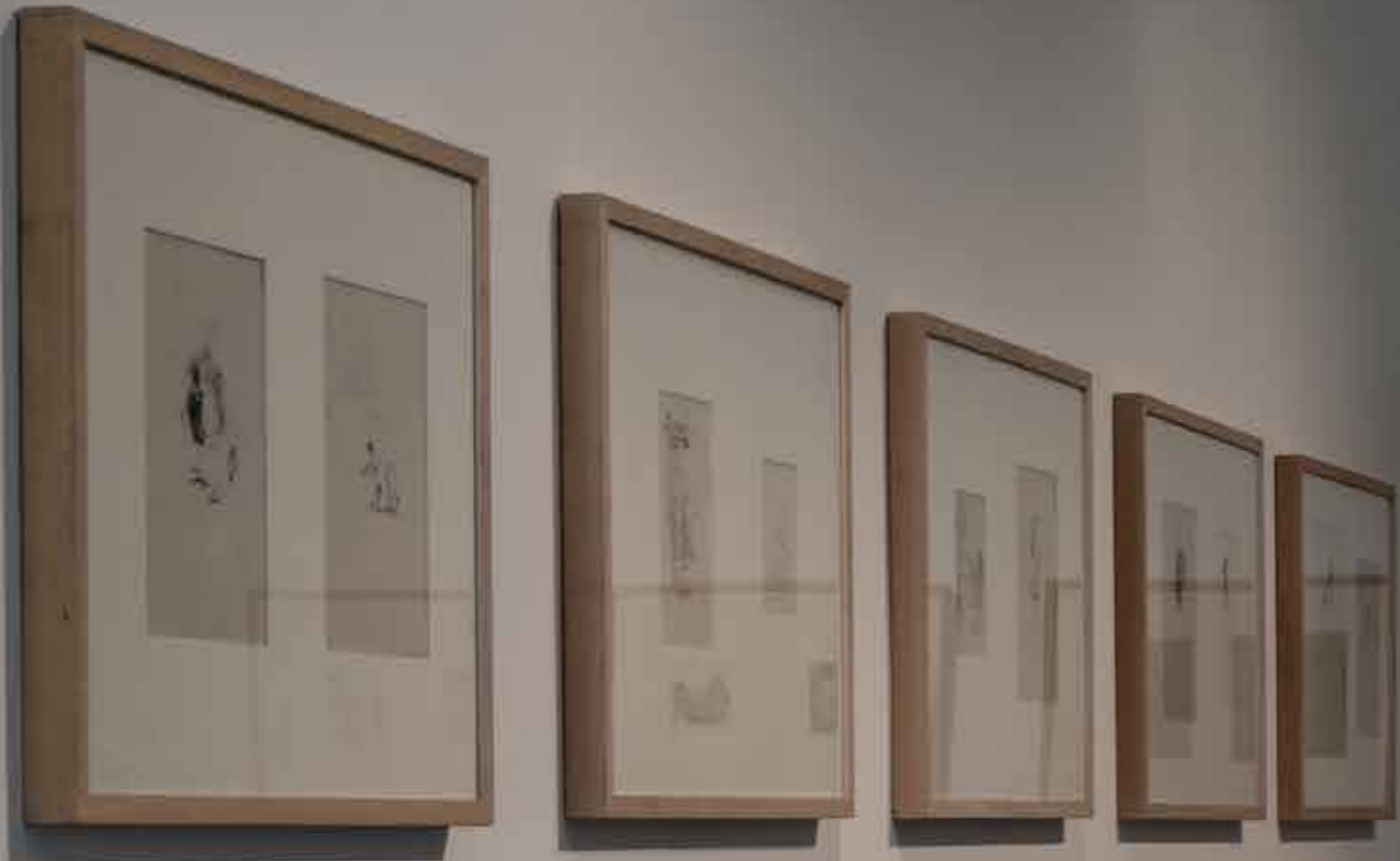
Small text labels below the framed artworks on the left wall.