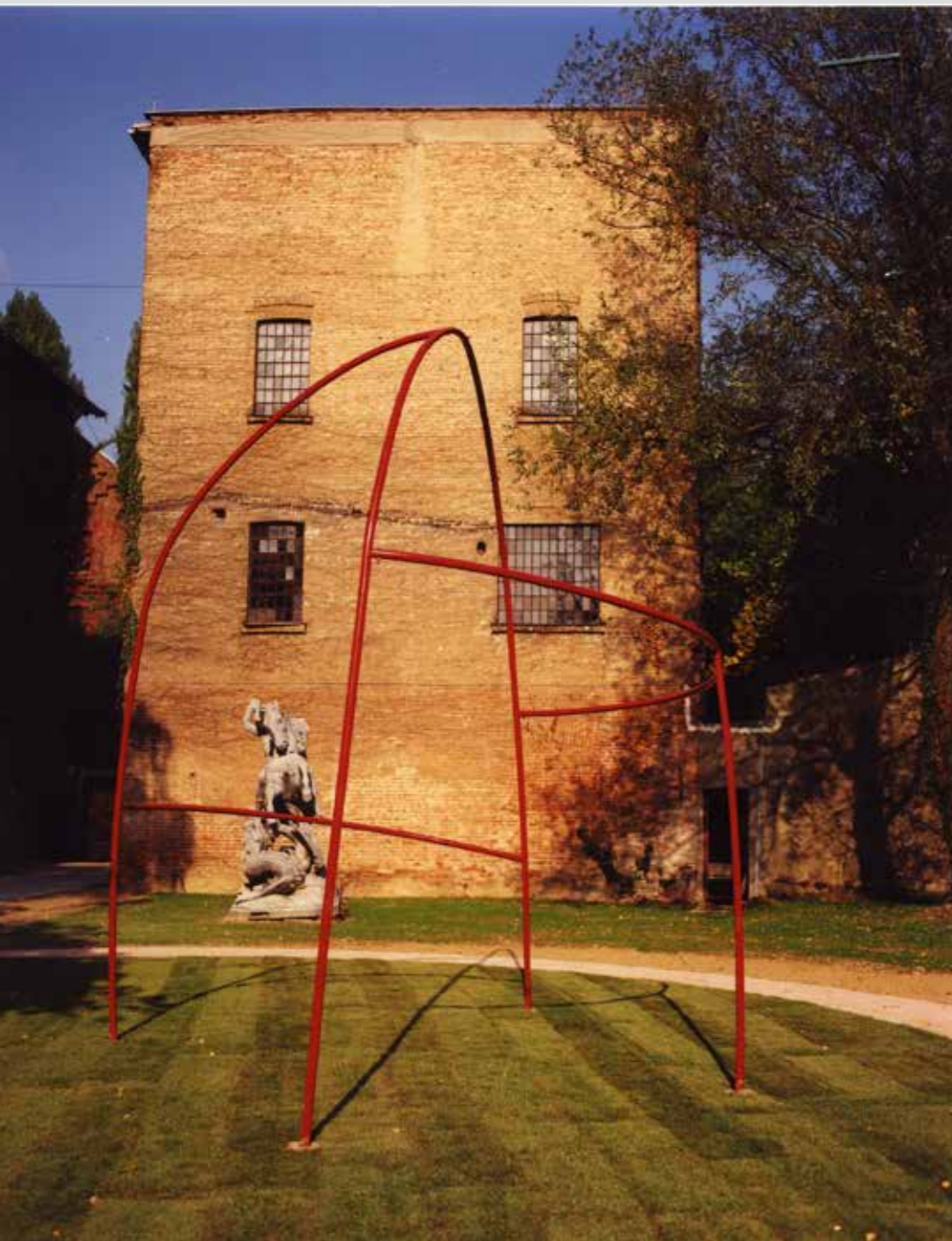
The Making of a Sculpture Shape of Space XIII at the GASA Glyptotheque, 2009 The 7 th Triennial of Croatian Sculpture: Sphere, 1959–2000